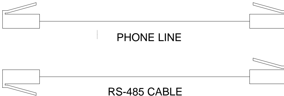
Illustration 2 - Phone Line and RS485 Cable NOTE THE DIFFERENT ORIENTATION OF THE CONNECTORS