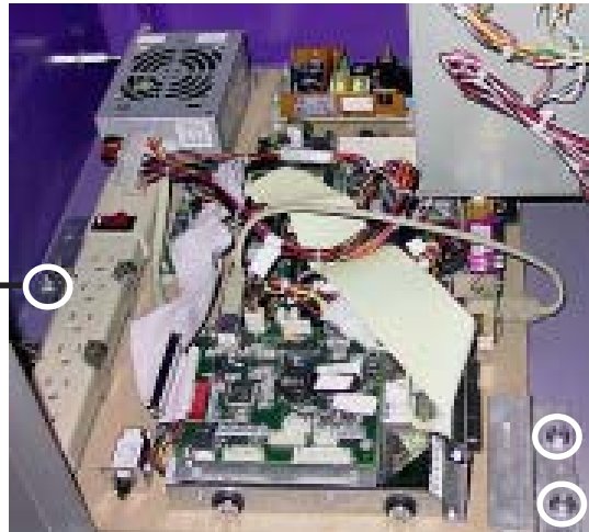
FIGURE 2 - CPU SECTION - ELECTRONICS TRAY MOUNTED ON BOTTOM WALL

BOLTS FASTENING ELECTRONICS TRAY TO GAME (3 TOTAL)