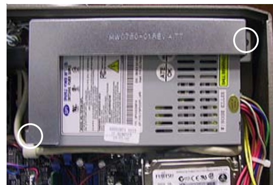
FIGURE 2 - POWER SUPPLY MOUNTING SCREWS (2 PLACES)