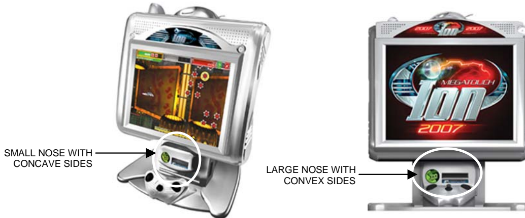
FIGURE 1 - STYLES OF EVO GAMES

NOTE: Your eVo game will have either a small bill acceptor nose or a large bill acceptor nose. Refer to Figure 1 to determine your style of game, then follow the appropriate instructions.