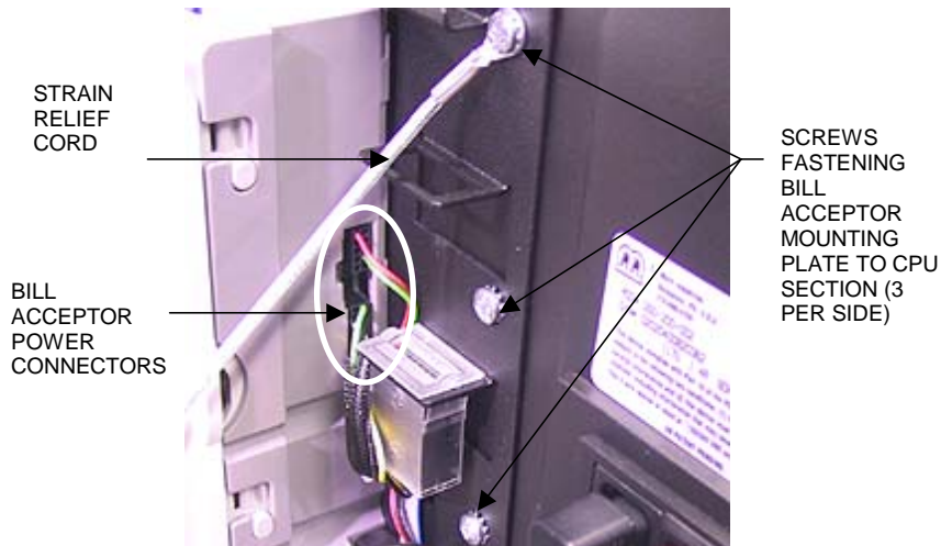
FIGURE 2 - REAR VIEW OF BILL ACCEPTOR MOUNTING PLATE