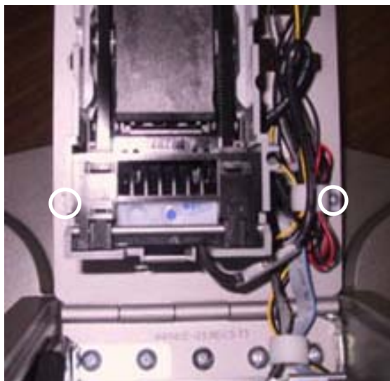
FIGURE 4 - SCREWS FASTENING LARGE BILL ACCEPTOR NOSE TO MOUNTING PLATE