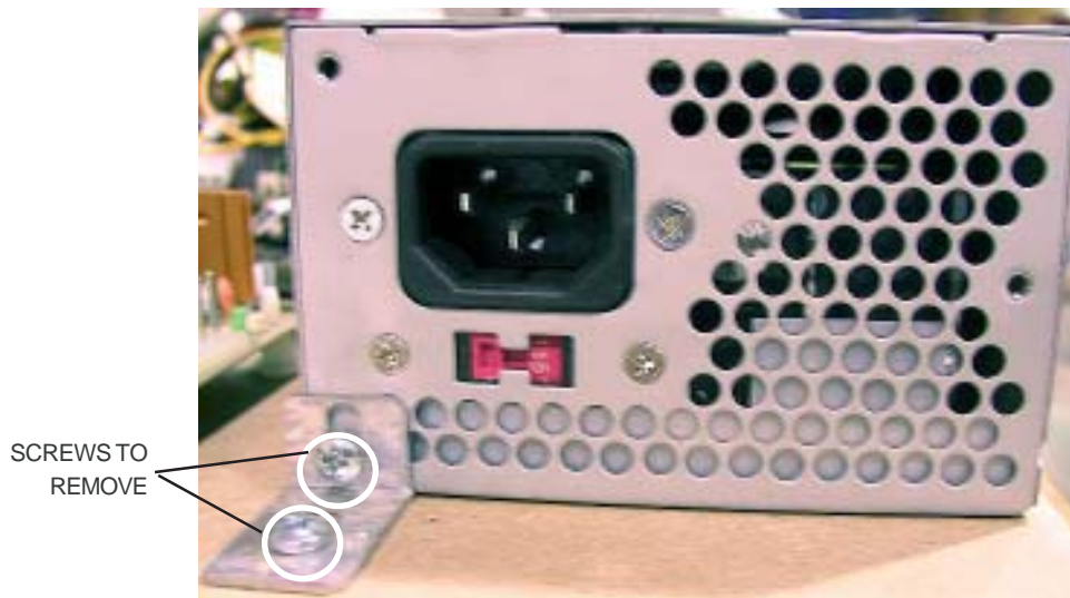
FIGURE 3 - CLOSEUP OF LEFT REAR BRACKET AND SCREWS RIGHT FRONT SCREWS ARE LOCATED DIAGONALLY (SEE FIGURE 2)