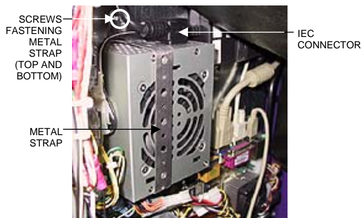
FIGURE 1 - CLOSEUP OF POWER SUPPLY WITH METAL STRAP