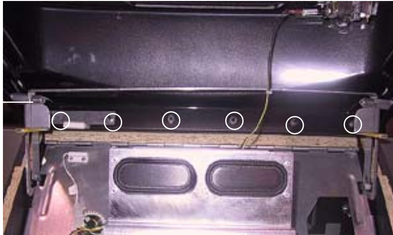
FIGURE 2 - SCREWS AND HEXNUTS SECURING HINGE - UNDER TOP BEZEL