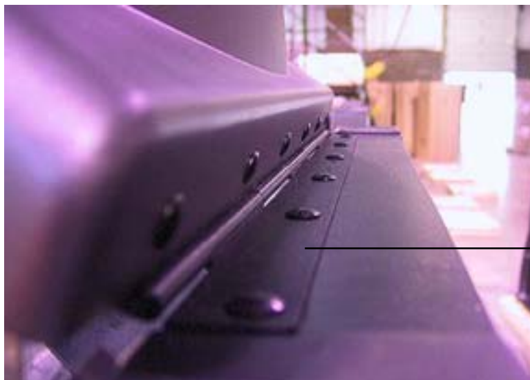
FIGURE 3 - EXTERIOR VIEW OF BRACKET - TOP VIEW OF THE GAME