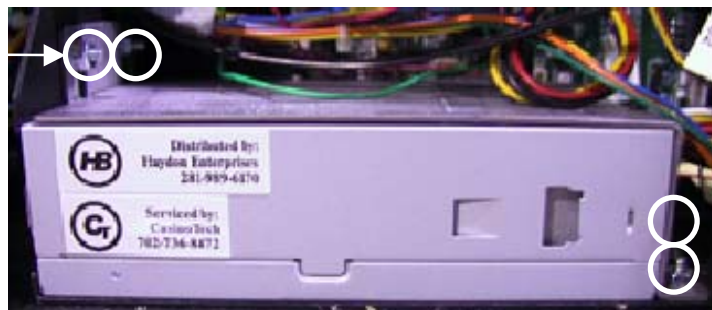
FIGURE 2 - POWER SUPPLY AND MOUNTING BRACKET

4 SHOULDER WASHERS SECURING POWER SUPPLY ASSEMBLY