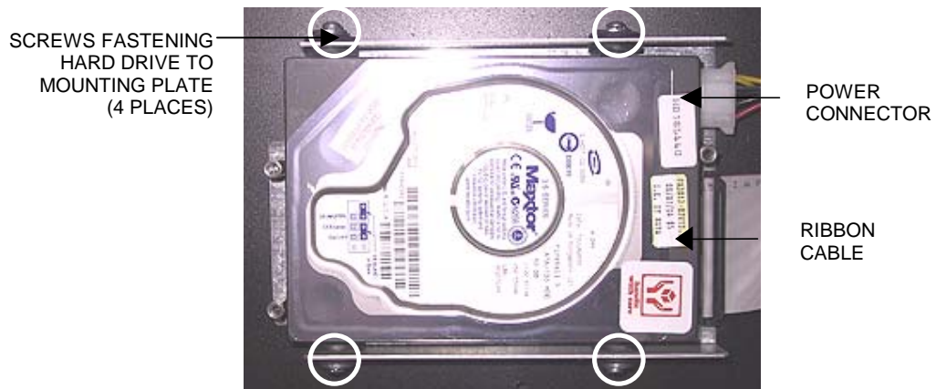
FIGURE 3 - HARD DRIVE