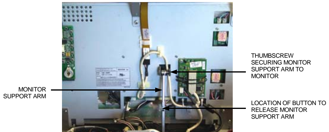
FIGURE 2 - REAR VIEW OF MONITOR ASSEMBLY