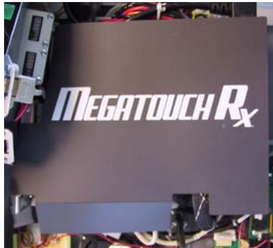
FIGURE 1 - RX MOTHERBOARD COVER