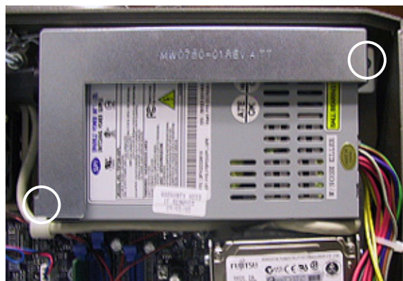
FIGURE 2 - POWER SUPPLY MOUNTING SCREWS (2 PLACES)