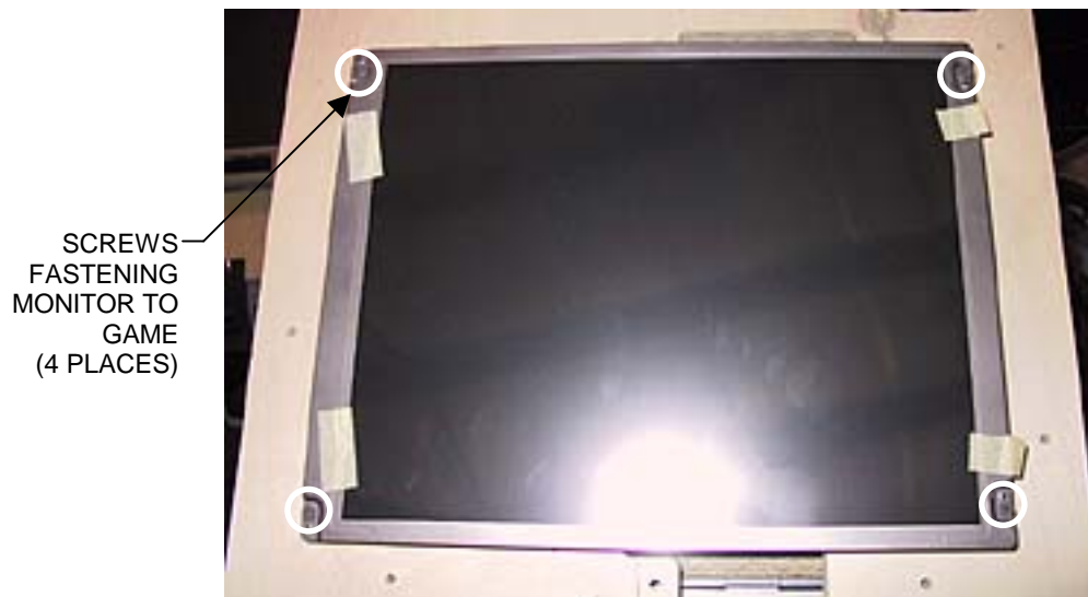
FIGURE 3 - MONITOR (WITH BEZEL REMOVED)