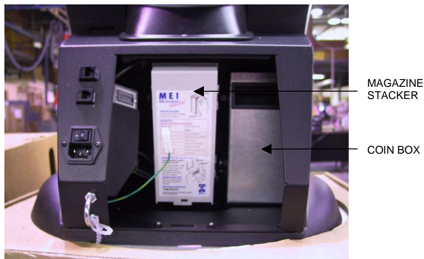
FIGURE 1 - ELITE EDGE - BILL ACCEPTOR ACCESS/REMOVAL