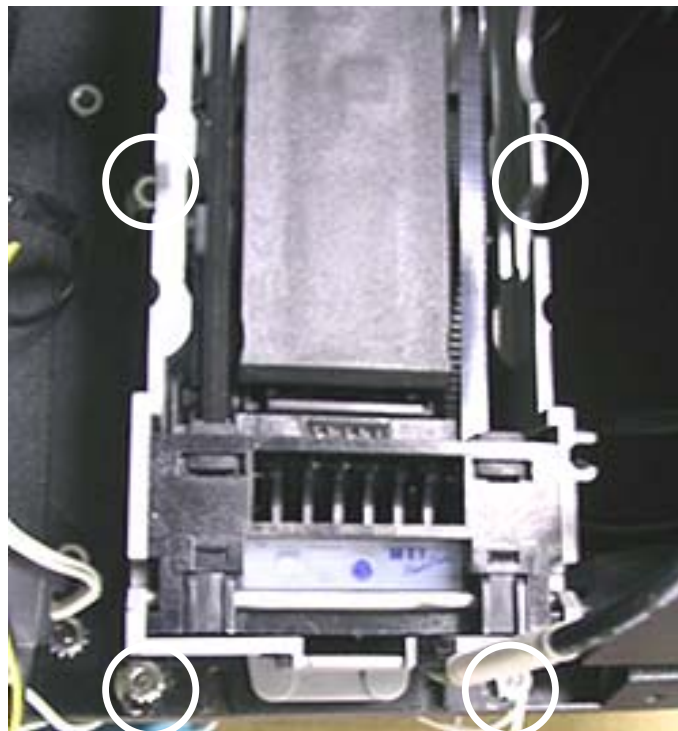
FIGURE 4 - SCREWS SECURING BILL ACCEPTOR TO MOUNTING PLATE