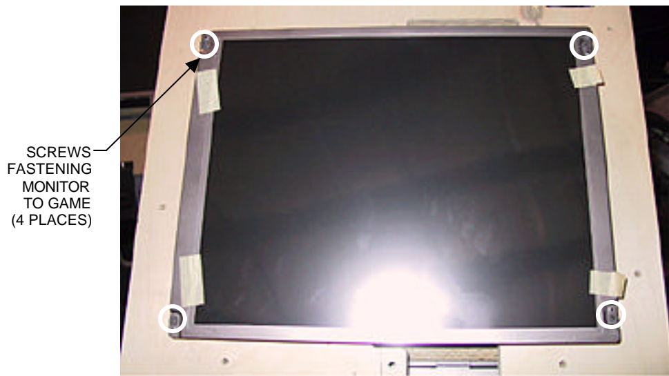
FIGURE 2 - MONITOR (WITH BEZEL REMOVED)