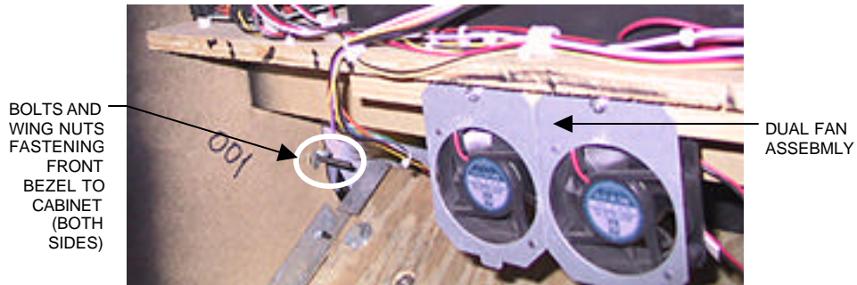
FIGURE 1 - MEGATOUGH COMBO JUKEBOX - INSIDE REAR OF CABINET

BOLTS AND WING NUTS FASTENING FRONT BEZEL TO CABINET (BOTH SIDES)