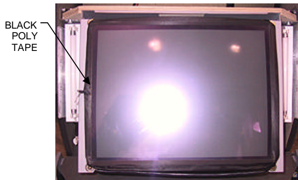
FIGURE 3 - MEGATOUGH COMBO JUKEBOX - INSIDE REAR OF CABINET