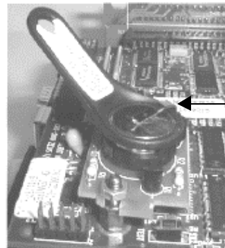
Round Dallas Security Key