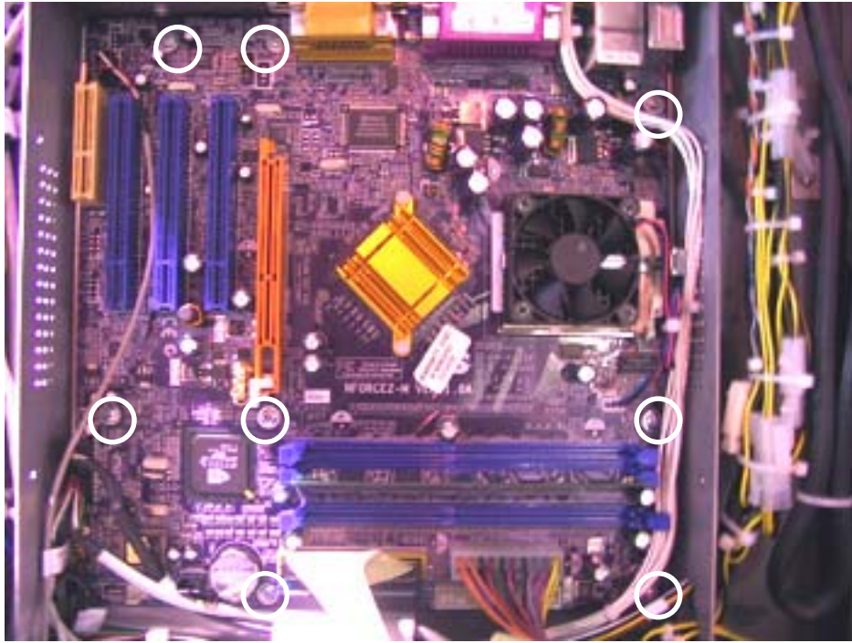
FIGURE 2 - SCREWS SECURING MOTHERBOARD