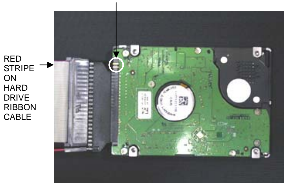
FIGURE 3 - CIRCUIT-BOARD SIDE OF HARD DRIVE